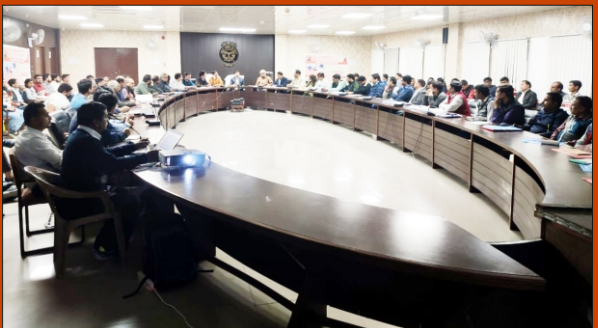
A Round Table Discussion on HBP 2.0 was held on February 20, 2020 with Empanelled Health Care Providers (Public & Private) in Bahraich District of Uttar Pradesh