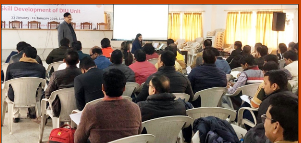
A Three Days Training Workshop on Skill Development of PM-JAY – DIU Unit was conducted by State Health Agency, Uttar Pradesh between January 22-24, 2020 at Training Hall,