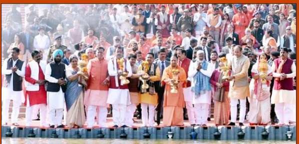
Honorable Chief Minister Inaugurated Ganga Yatra (27-31 January, 2020) in Bijour District, Uttar Pradesh