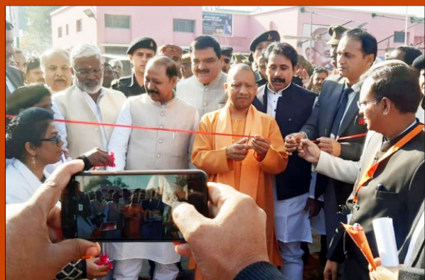
Honorable Chief Minister Shri Yogi Adityanath Singh inaugurated Arogya Mela on February 16 th 2020 at PHC Baragaon in Varanasi