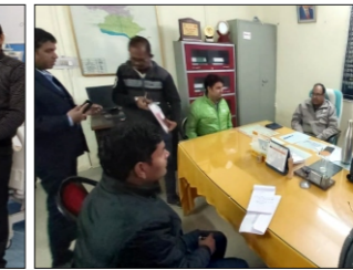
Sant Kabir Nagar