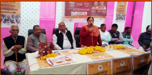
Special Golden Card Drive in Mahoba District