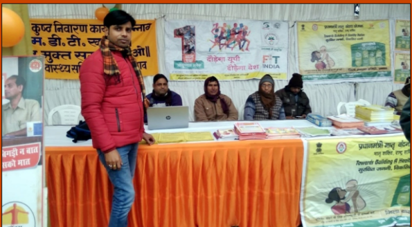
AB PMJAY- Stall in an Exhibition organized by National Rural Livelihood Mission at Unique Resort Unnao