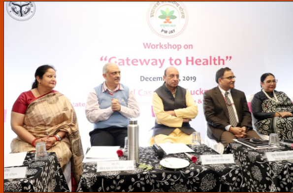
SACHIS organized 'Gateway to Health' workshop at Hotel Casaya Inn, Gomtinagar, Lucknow