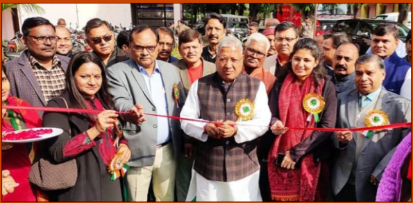
Hon'ble MP Shri Rajendra Agarwal inaugurated Ayushman Swasthya Mela in Meerut District